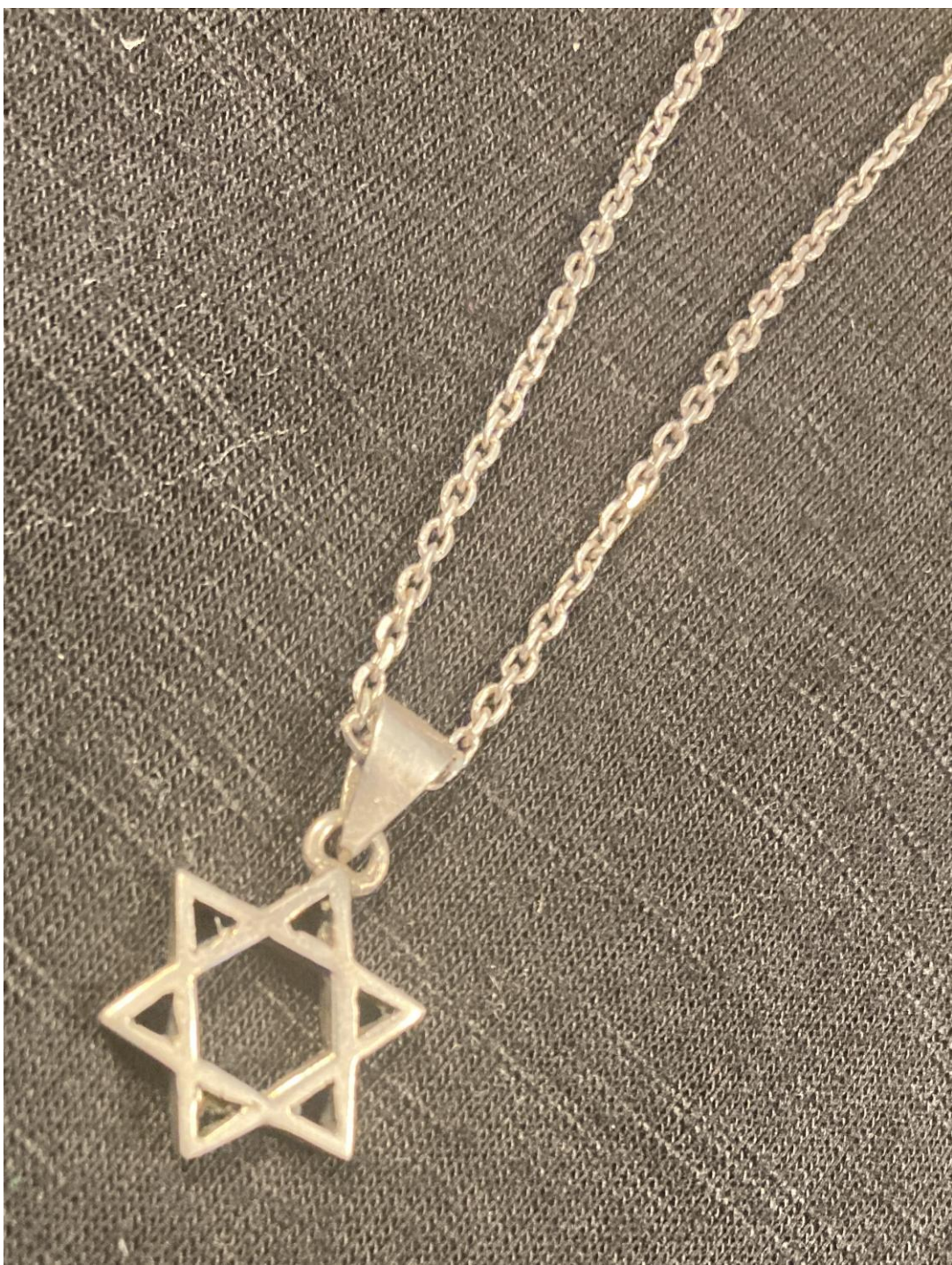
A Star of David necklace